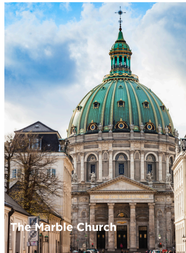
The Marble Church