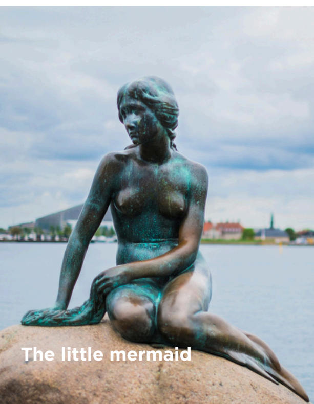
The little mermaid